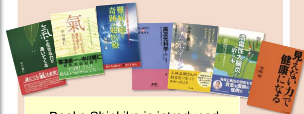
Books Shinkiko is introduced